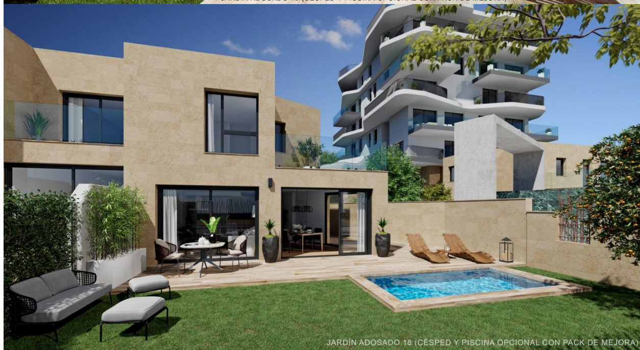
JARDÍN ADOSADO 18 (CÉSPED Y PISCINA OPCIONAL CON PACK DE MEJORA)