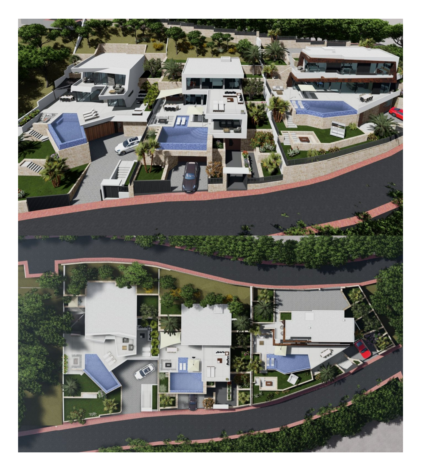
"Experience our experience - Because you deserve the best"