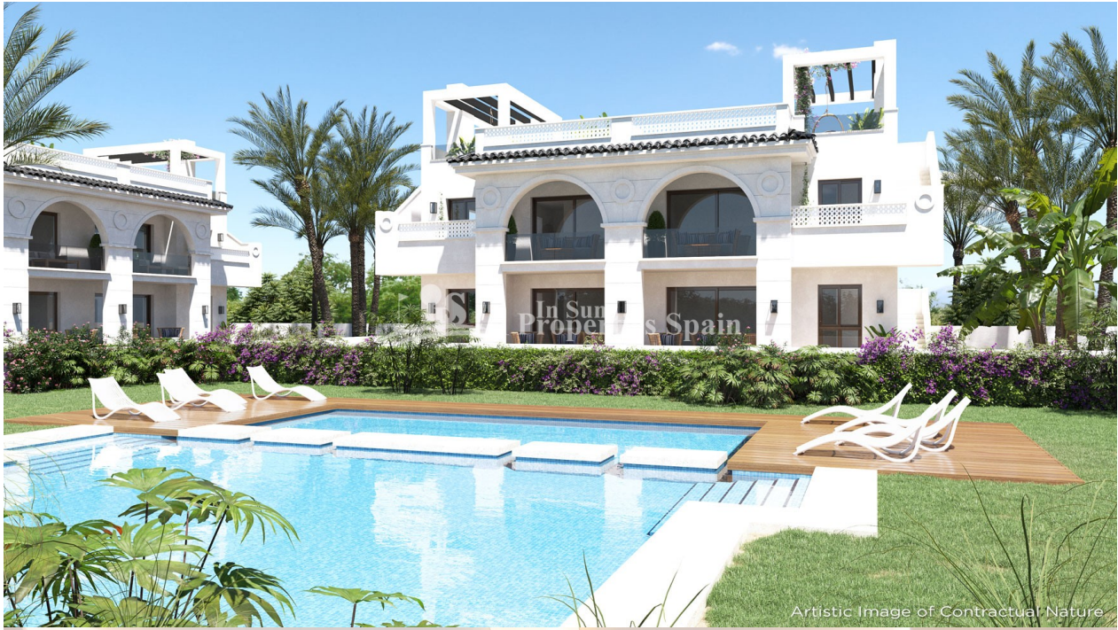
Artistic Image of Contractual Nature