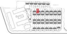
VIVIENDA 14 ESCALA 1/75