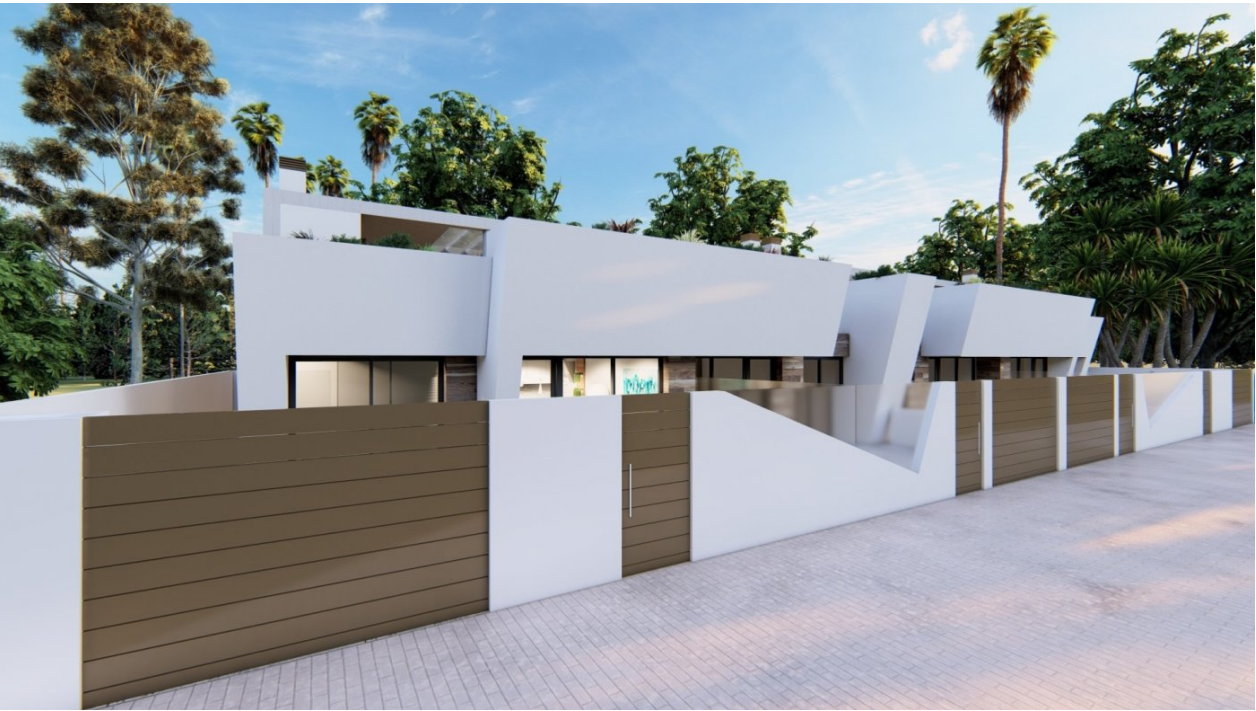
VIVIENDA M1 01