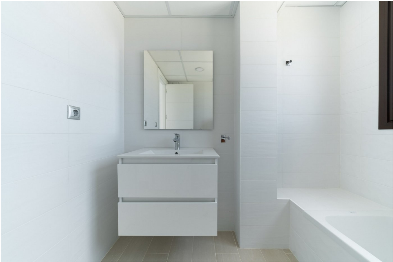
PLANTA SEGUNDA - SECOND FLOOR