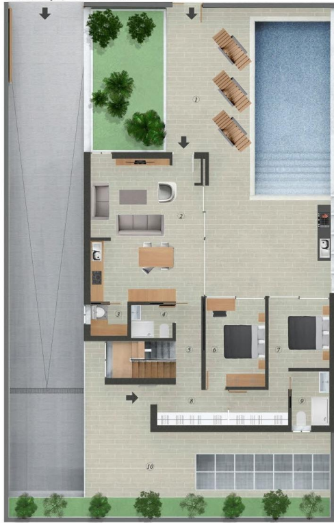
Planta Baja / Ground Floor