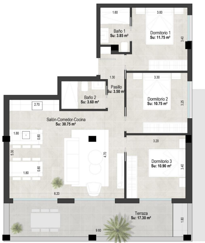
tabla de superficies