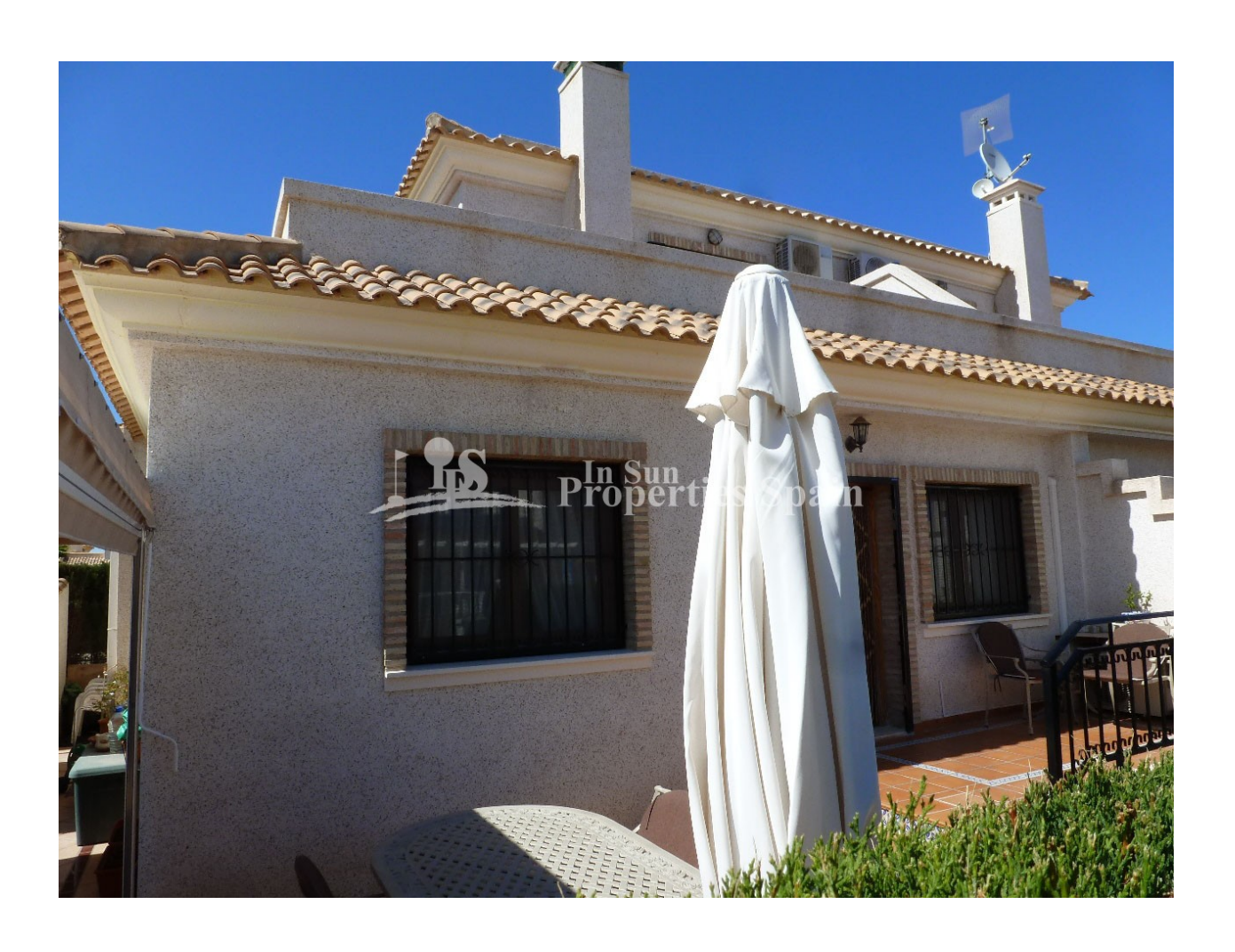
"Experience our experience - Because you deserve the best"