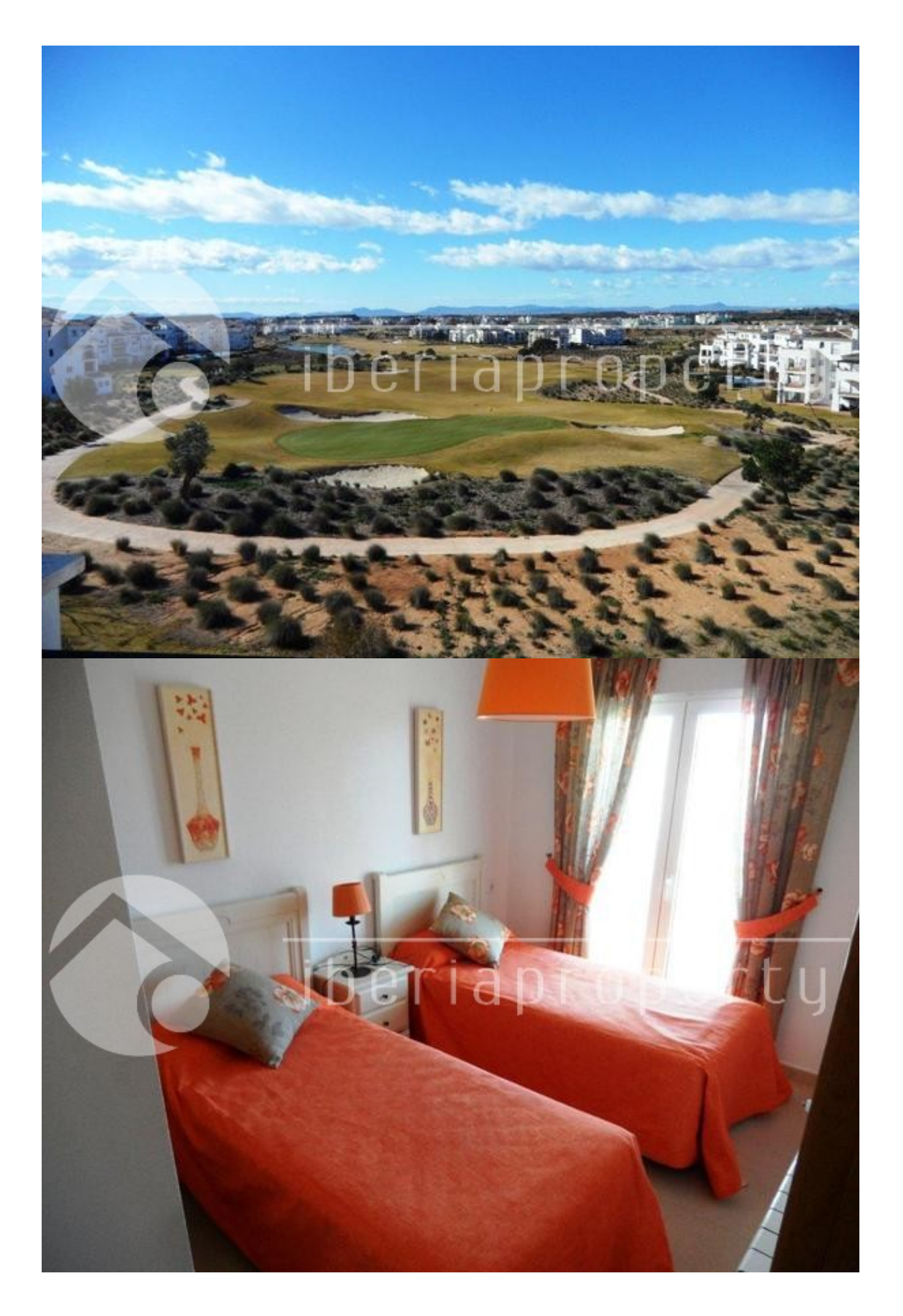
"Experience our experience - Because you deserve the best"