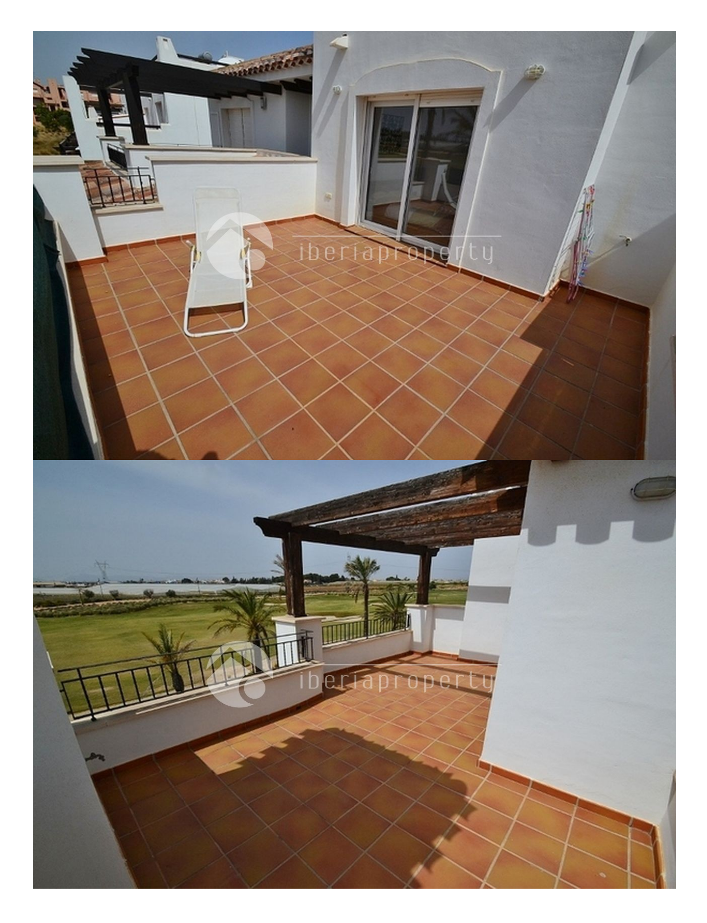
"Experience our experience - Because you deserve the best"