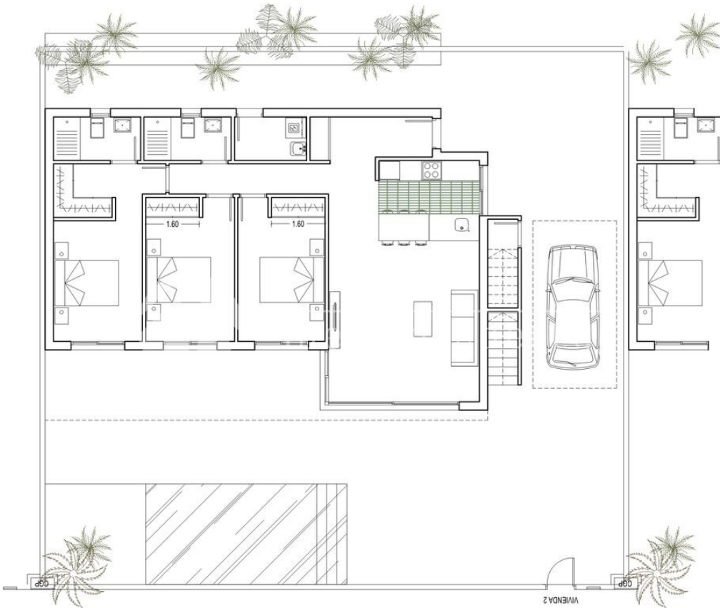
Cuadro de superficies