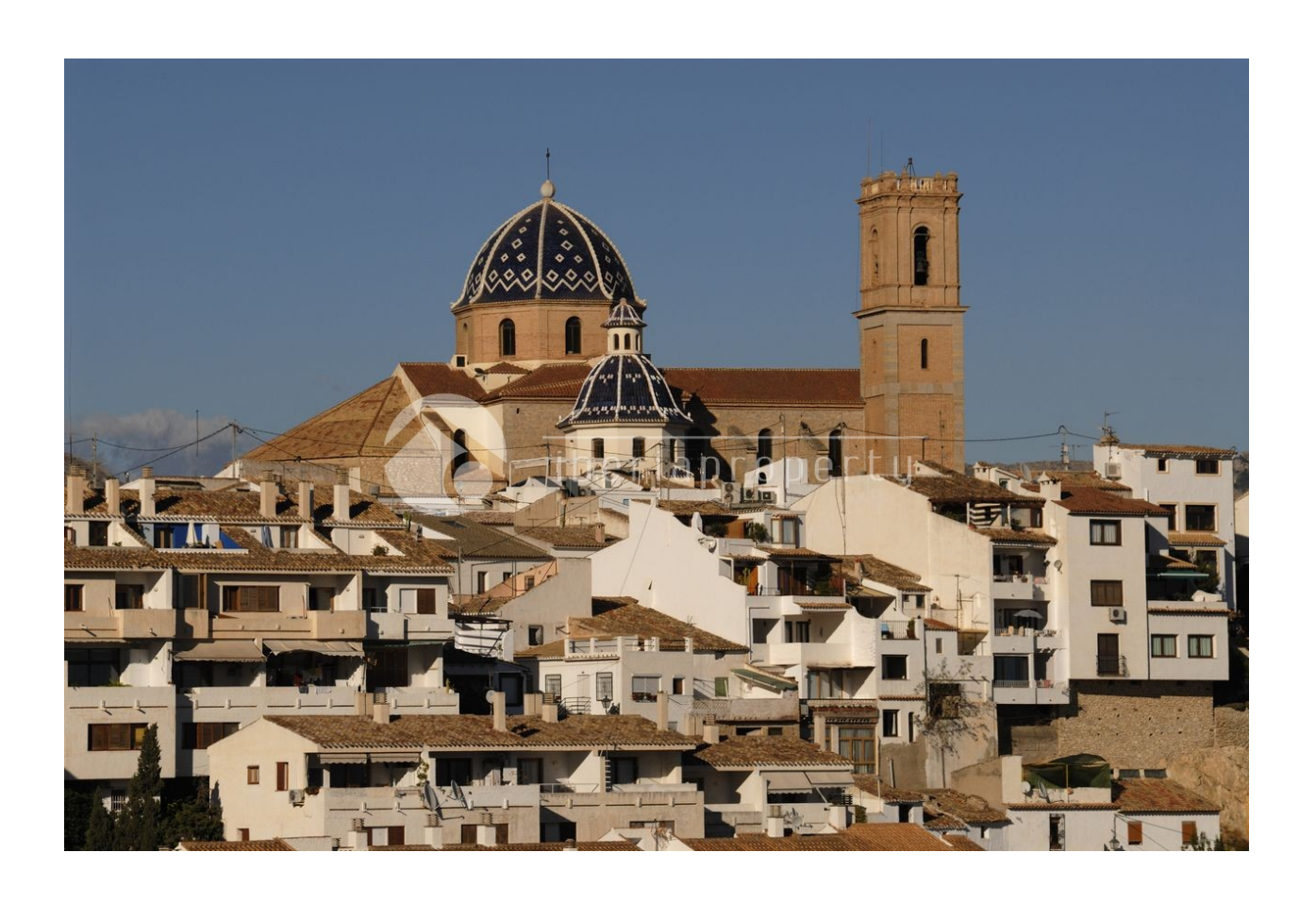
"Experience our experience - Because you deserve the best"