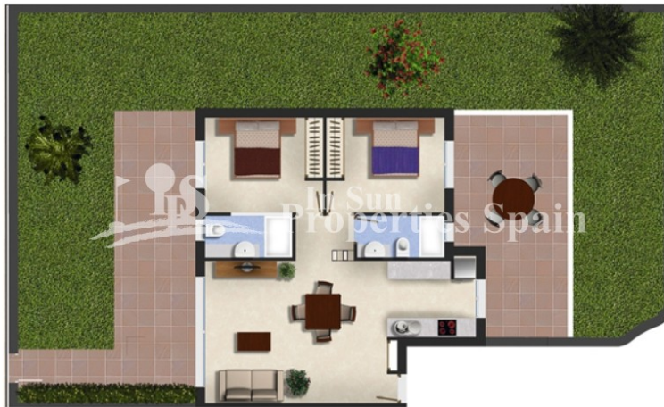
Imagen Artística carece de valor contractual/Artistic Image free of contractual nature

Model: Garden Property: 89,78-99,88m 2 Garden: 20-126m 2 2 Bedrooms - 2 Bathrooms