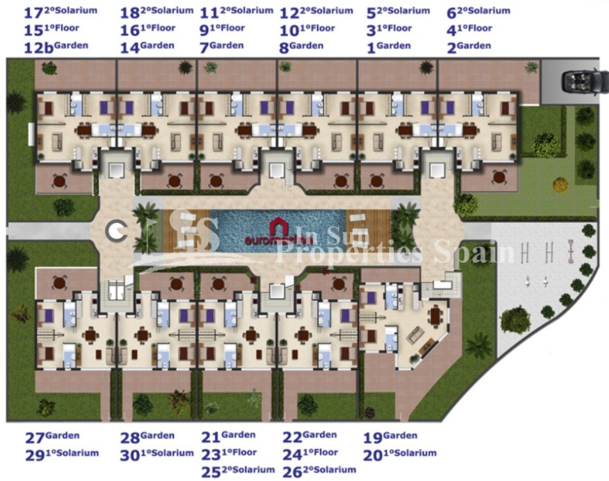
Imagen Artística carece de valor contractual/Artistic Image free of contractual nature