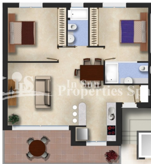
Imagen Artística carece de valor contractual/Artistic Image free of contractual nature

Model: 1 o Floor Property: 88,26-94,23m 2 2 Bedrooms - 2 Bathrooms