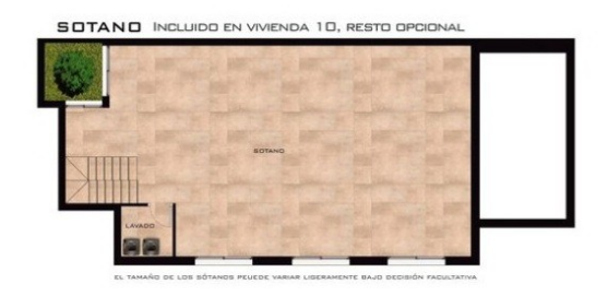
IMAGEN SIN VALOR CONTRACTUAL