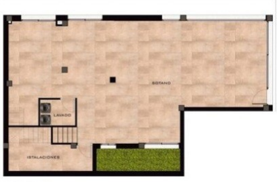
SOTANO (INCLUIDO EN VIV. 1, 21 Y 22. RESTO OPCIONAL) EL TAMAÑO DE LOS SÓTANOS PUEDE VARIAR LOGRAMENTE BAJO DECISIÓN FADULTATIVA