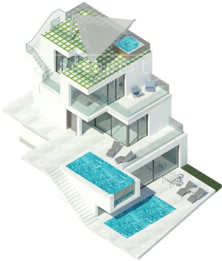
Programa Planta Cubierta Solarium : 52,33 m 2