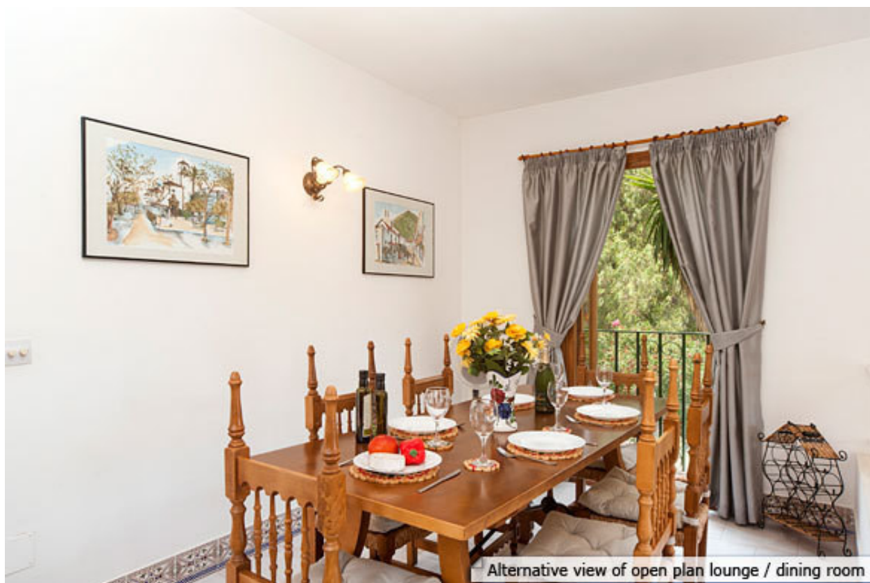
Alternative view of open plan lounge / dining room