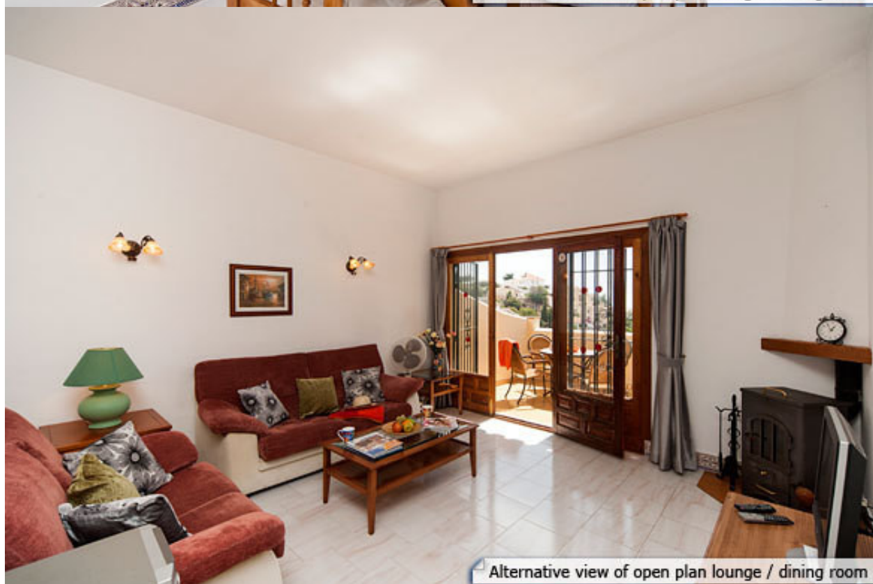
Alternative view of open plan lounge / dining room