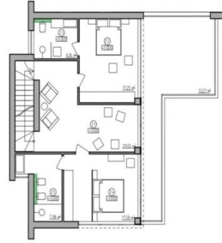
PLANTA PRIMERA 111 m 2