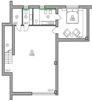
PLANTA SÓTANO 96 m 2