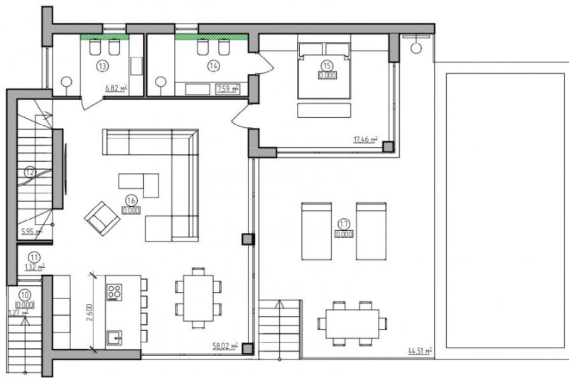
PLANTA PRIMERA 111 m 2