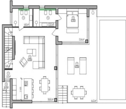
PLANTA BAJA 143 m 2